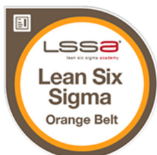
Figure 1 – Digital badge

Lean Six Sigma training is provided by a global network of ‘Accredited Training Organizations’ (ATOs). These ATOs provide training programs that are aligned to the LSSA Skill sets. Examination is provided through the LSSA directly or through APM Group Limited. The exams are open to all. Individuals can apply directly or sign up via one of the ATOs. It is recommended that candidates receive training through an ATO to prepare for certification. Check the LSSA website for an overview of ATOs and the actual exam requirements. On the website you will also find information about how you can claim your Digital badge. Then share your Digital badge on LinkedIn and show that you are active as an Orange Belt.